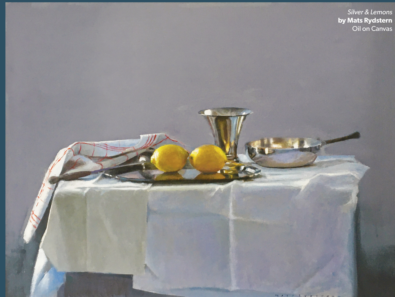
Silver & Lemons by Mats Rydstern Oil on Canvas

Telephone: 07872 601662 | Email: jeff.durant@otiumpartners.com www.otiumpartners.com