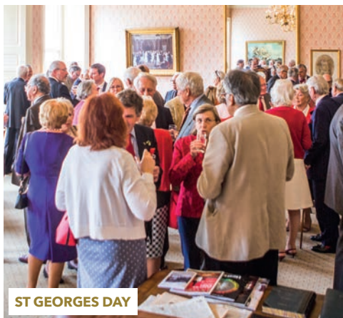
ST GEORGES DAY