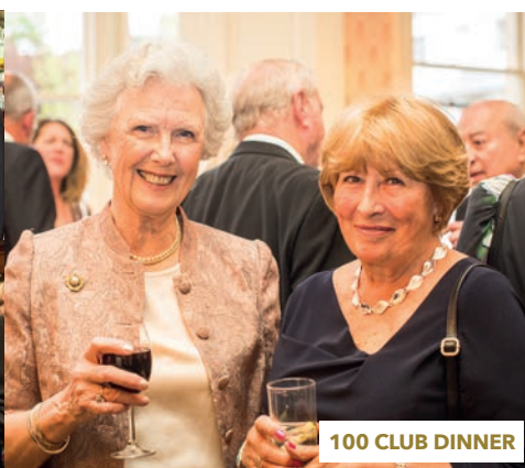
100 CLUB DINNER